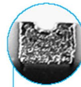
U-Shaped Product with Electrode Structure Processed product with grooves